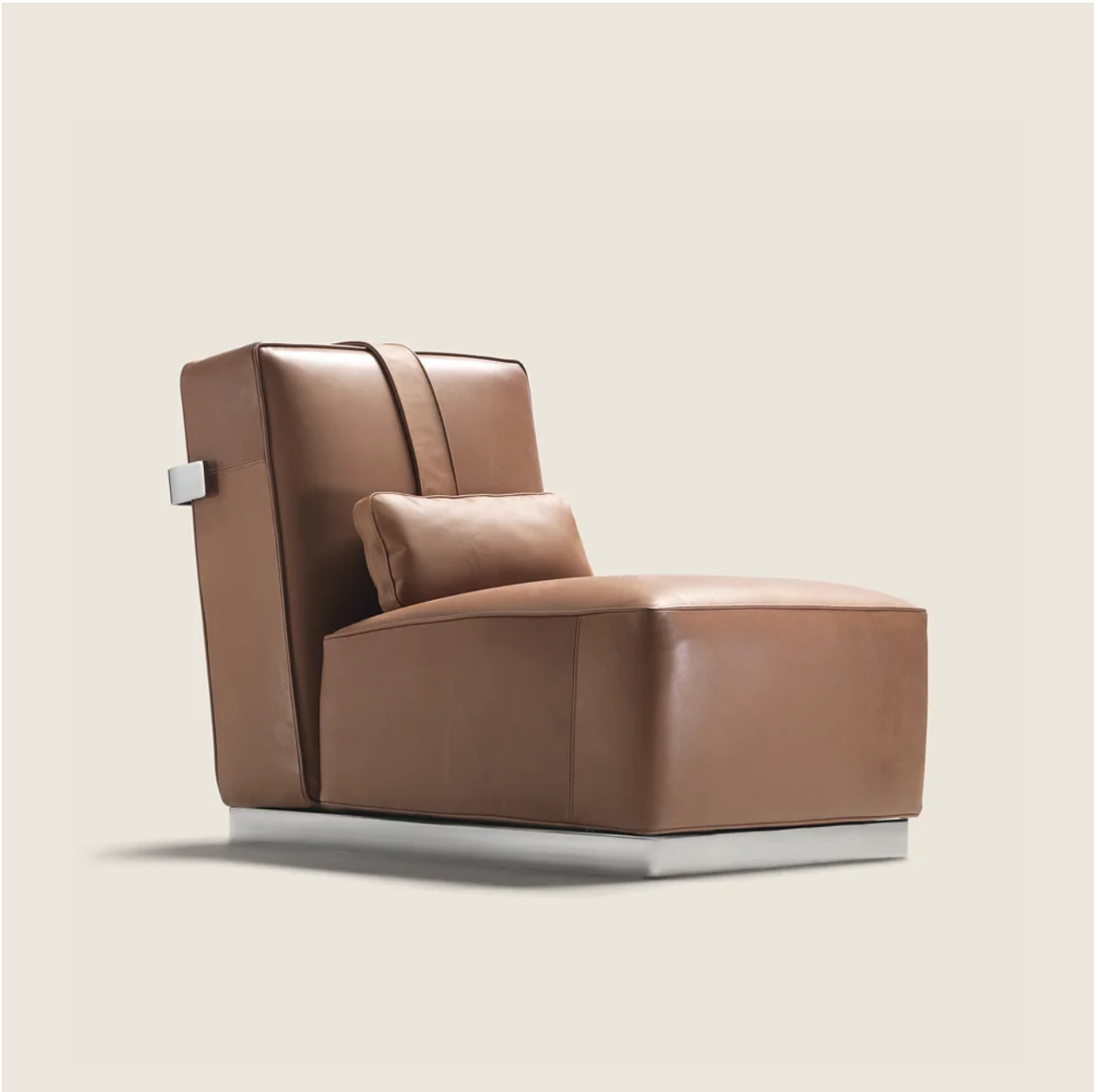
A.B.C.D. ANTONIO CITTERIO 2014 ARMCHAIRS