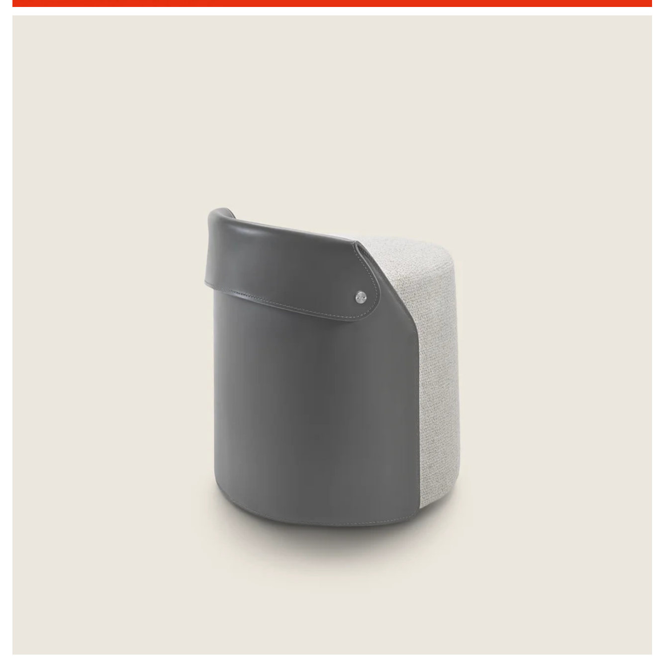
OZZY PATRICK NORGUET 2024 OTTOMANS