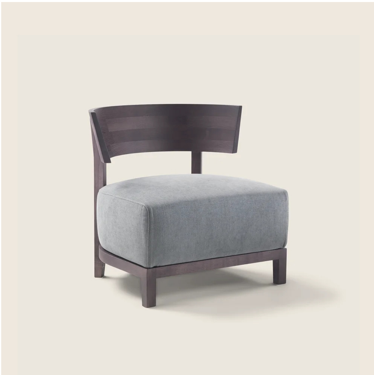
THOMAS ANTONIO CITTERIO 2000 ARMCHAIRS