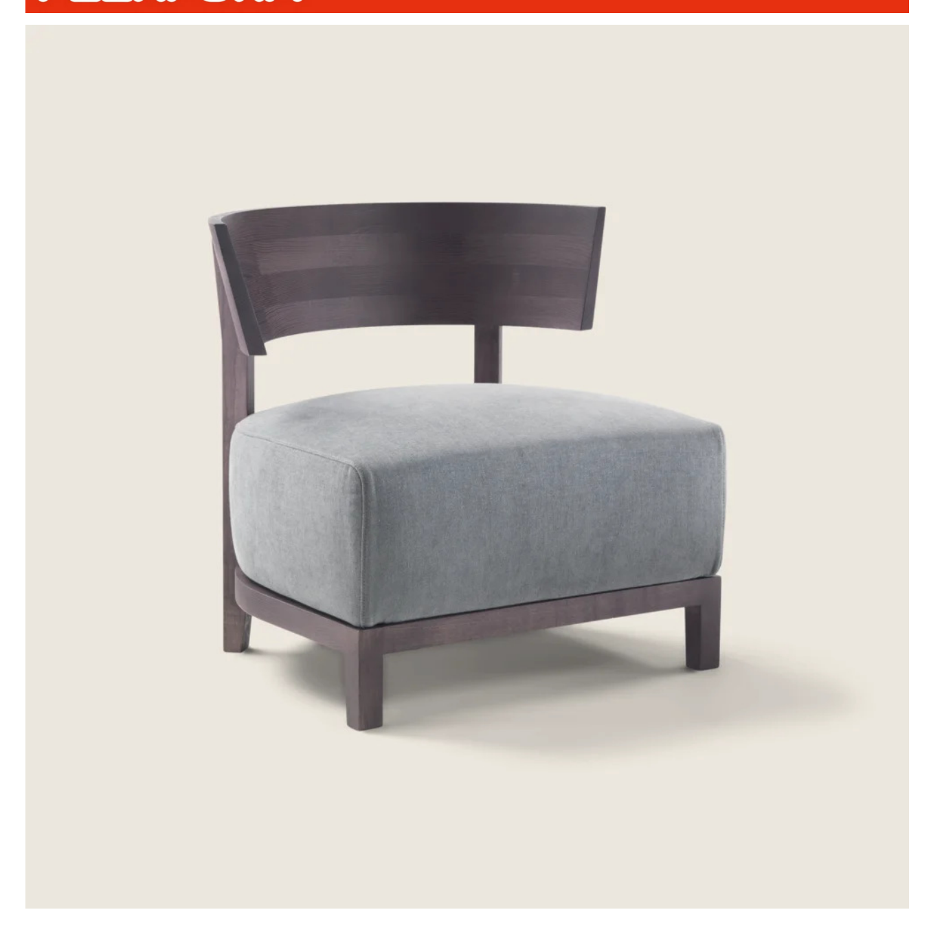
THOMAS ANTONIO CITTERIO 2000 ARMCHAIRS