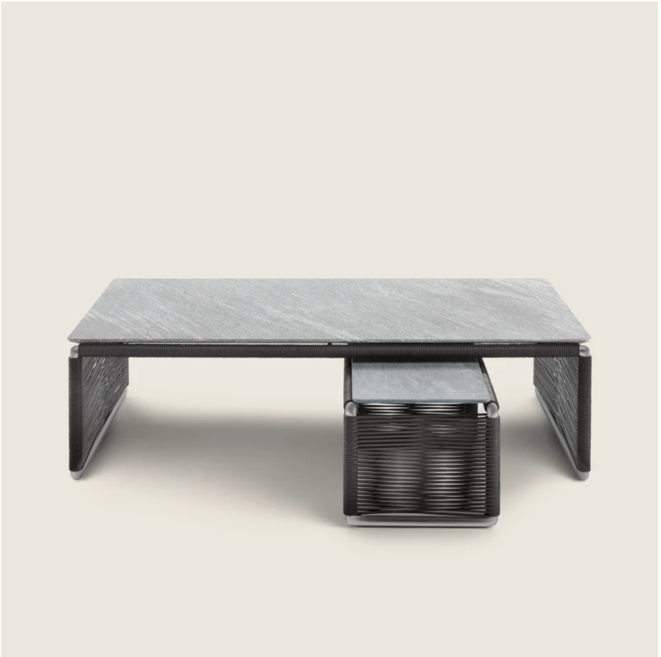
TINDARI OUTDOOR ANTONIO CITTERIO 2019 COFFEE AND SIDE TABLES