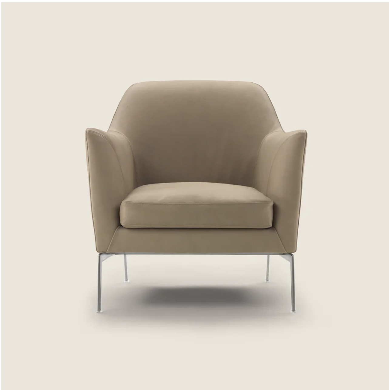
LUCE ANTONIO CITTERIO 2015 ARMCHAIRS