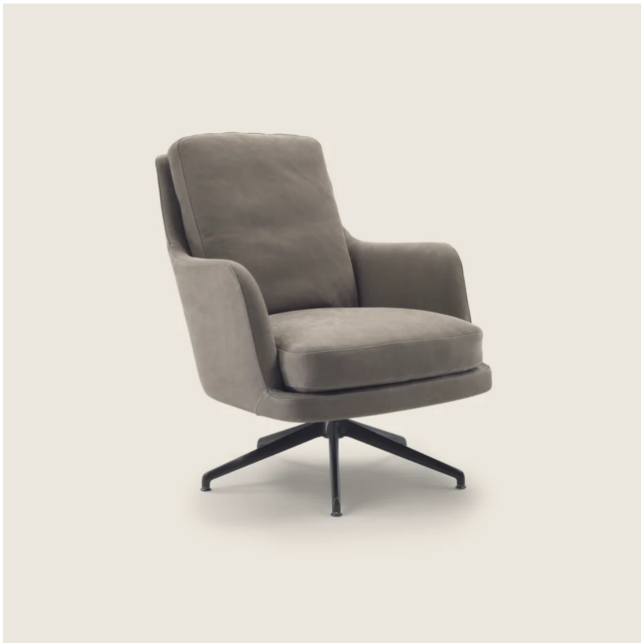
MARLEY ANTONIO CITTERIO 2021 ARMCHAIRS