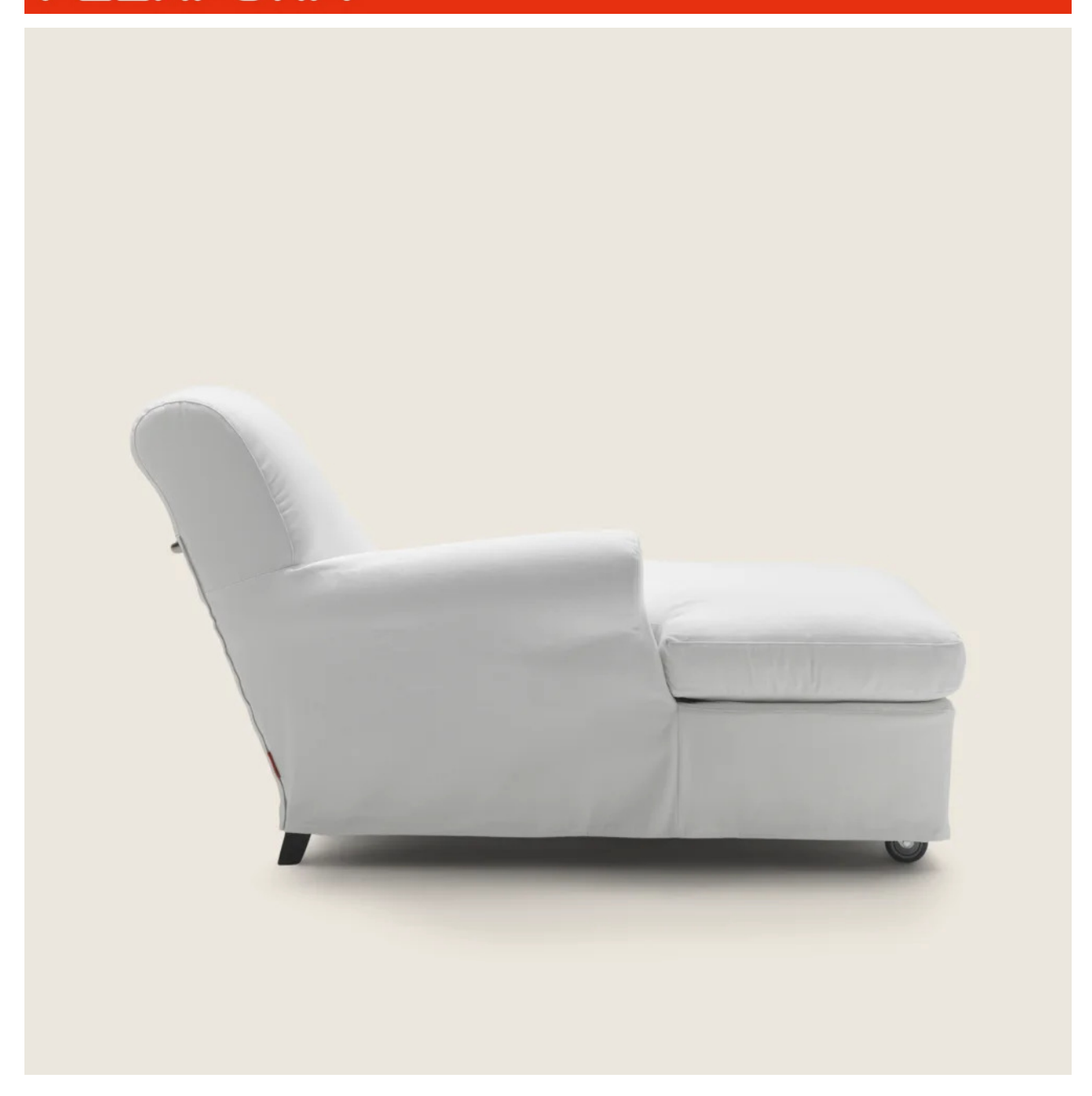
NONNAMARIA DESIGN CENTER 1985 CHAISE LONGUE/DORMEUSE