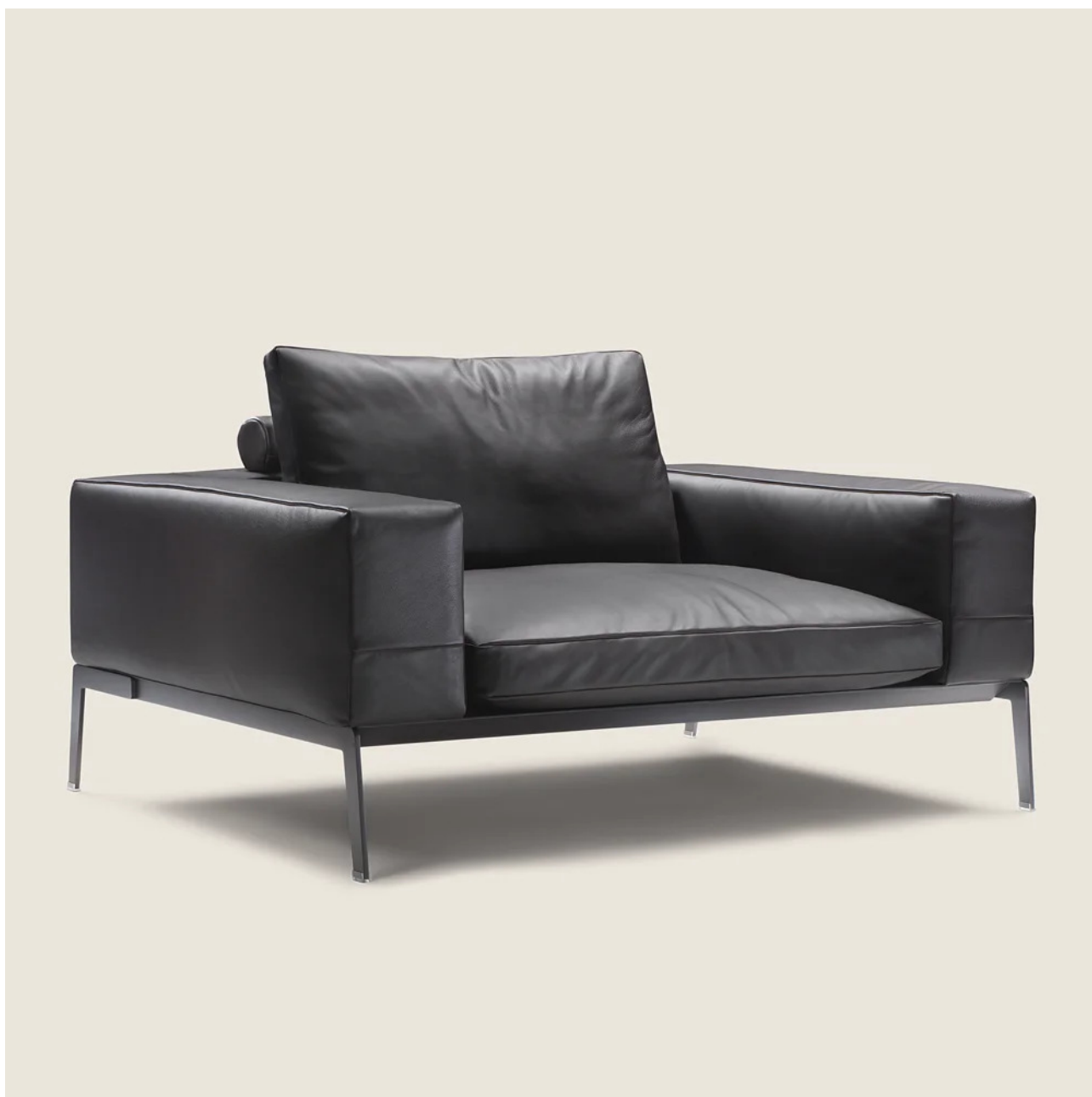
LIFESTEEL ANTONIO CITTERIO 2006 ARMCHAIRS