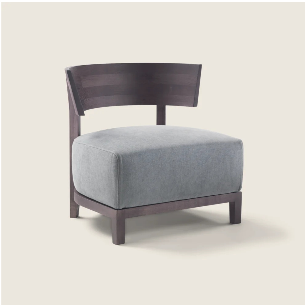
THOMAS ANTONIO CITTERIO 2000 ARMCHAIRS