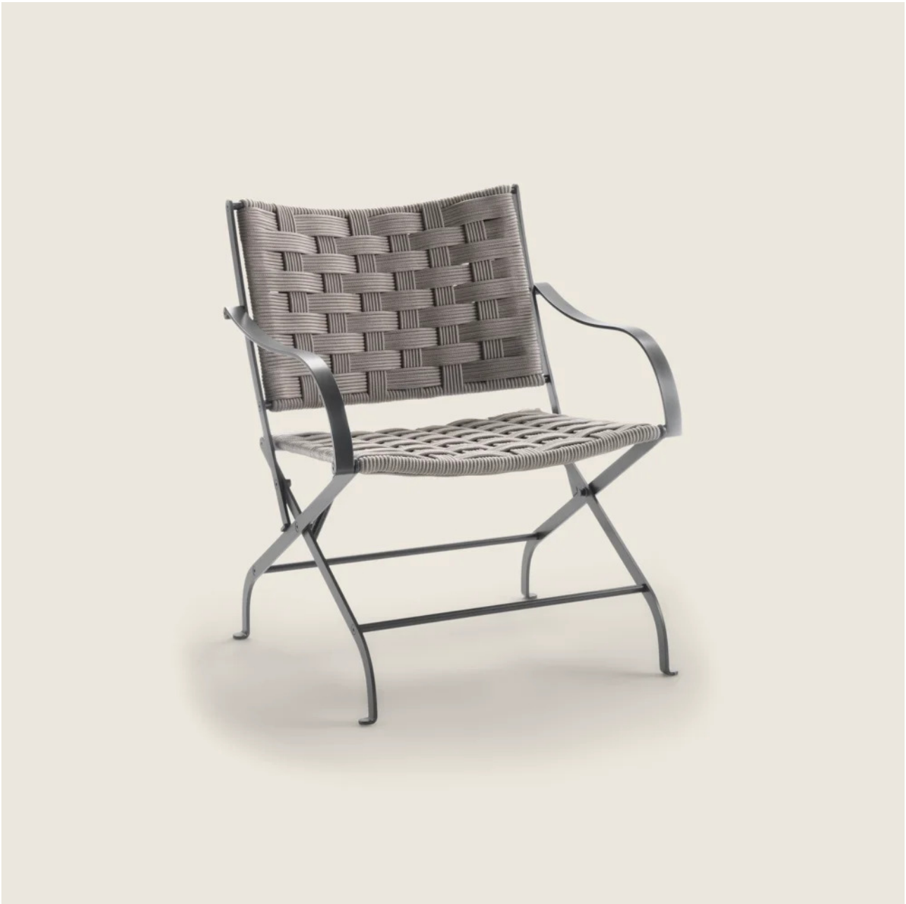
CARLOTTA OUTDOOR ANTONIO CITTERIO 2020 ARMCHAIRS