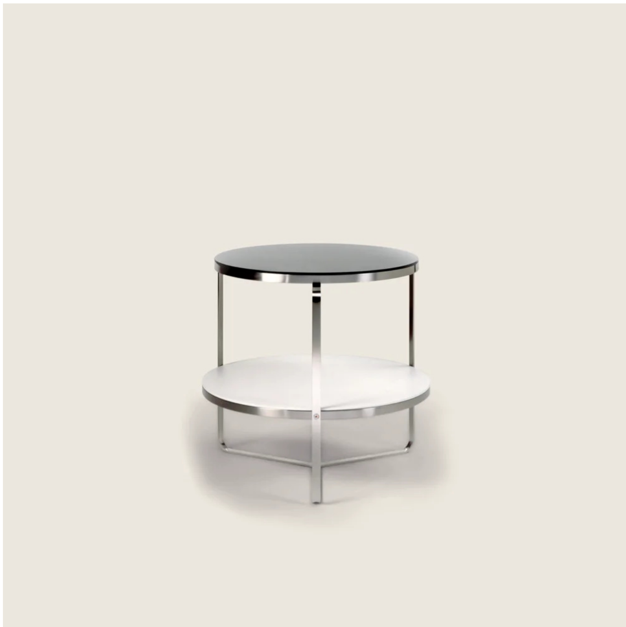
CARLOTTA ANTONIO CITTERIO 1996 COFFEE AND SIDE TABLES