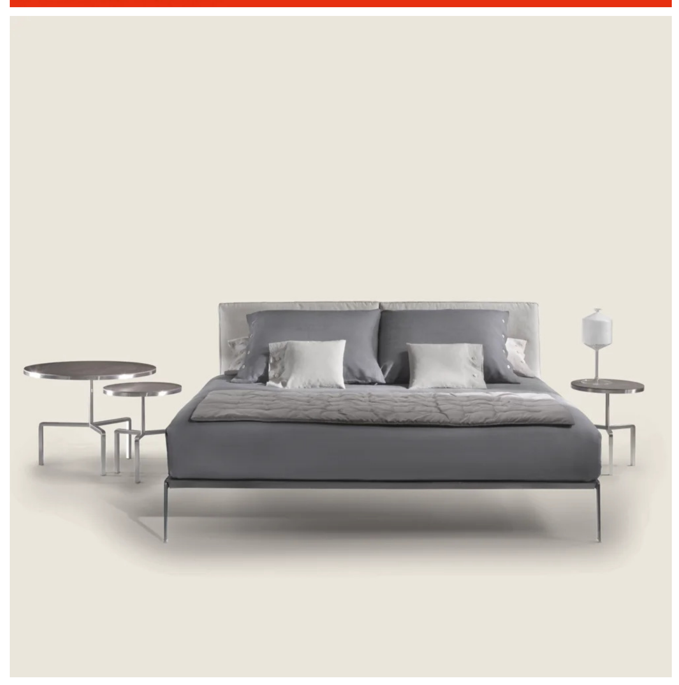
LIFESTEEL ANTONIO CITTERIO 2006 BEDS/BED ACCESSORIES