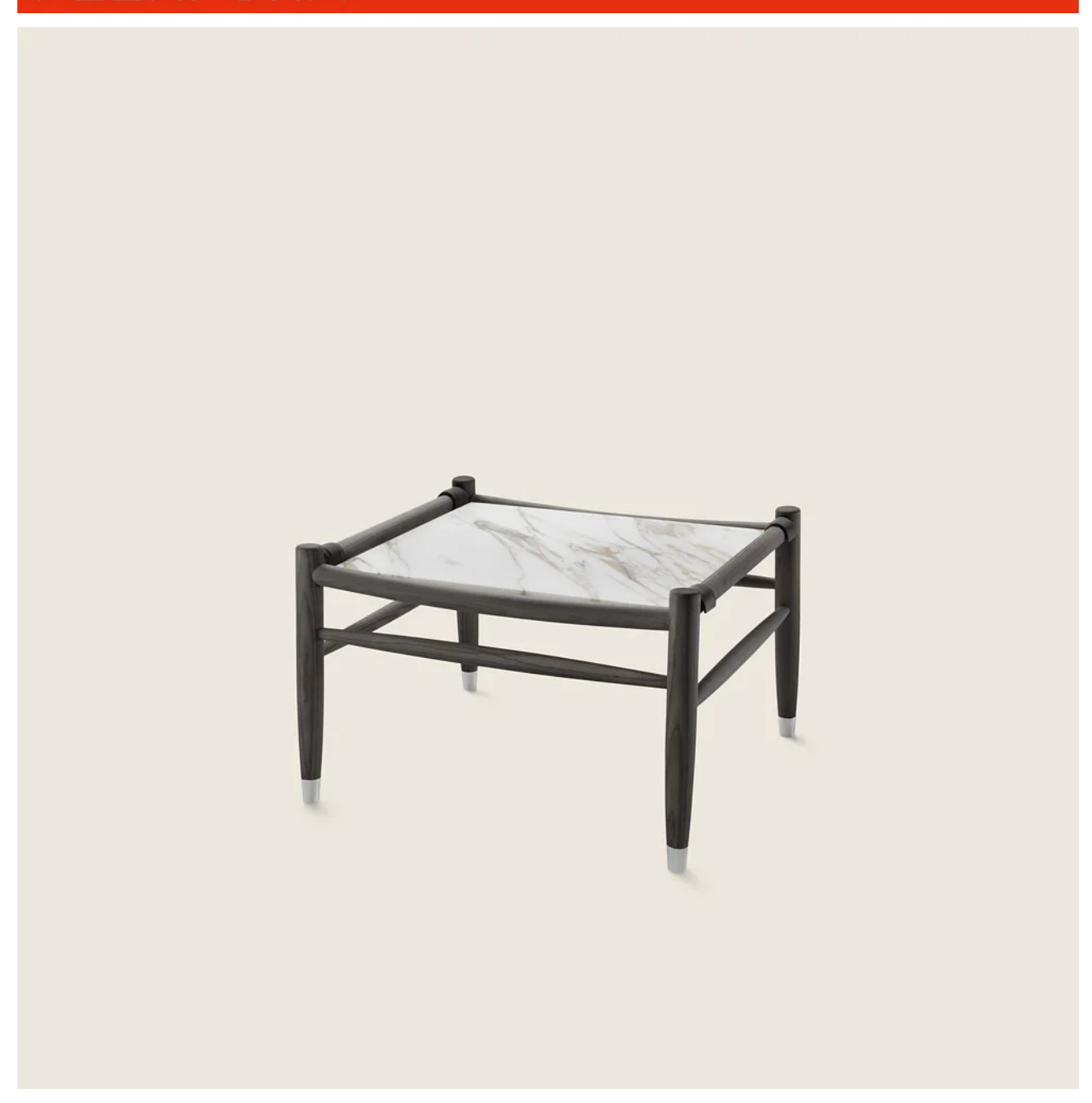
TESSA | TESSA S.H. ANTONIO CITTERIO 2020 COFFEE AND SIDE TABLES