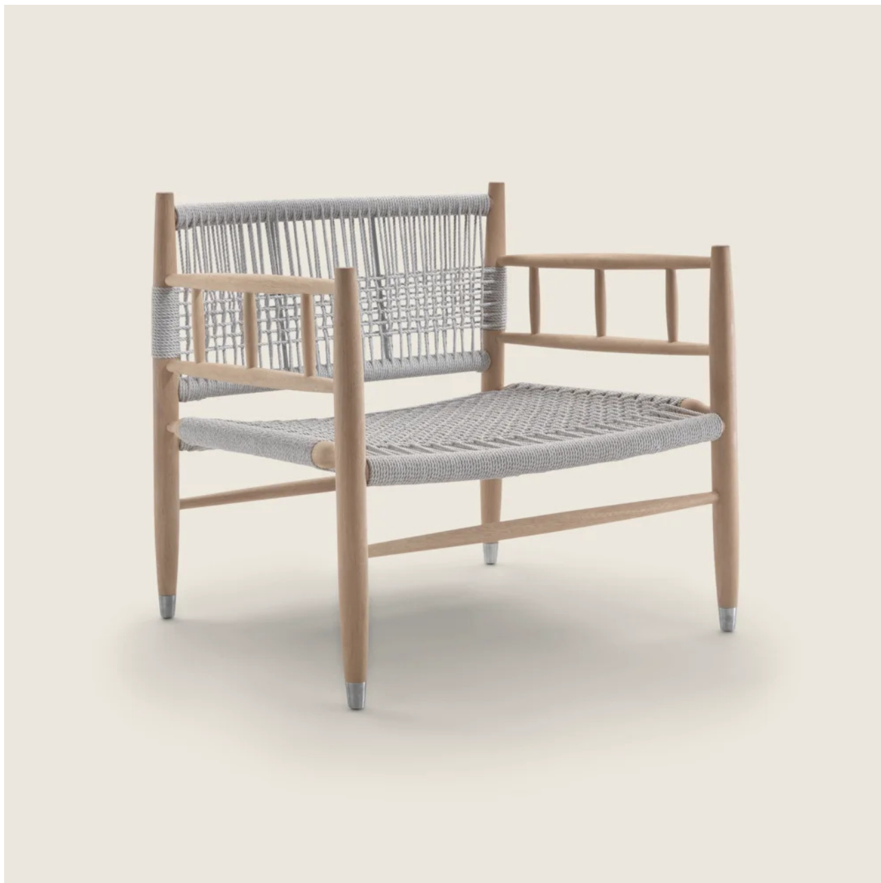
LEE OUTDOOR ANTONIO CITTERIO 2021 ARMCHAIRS