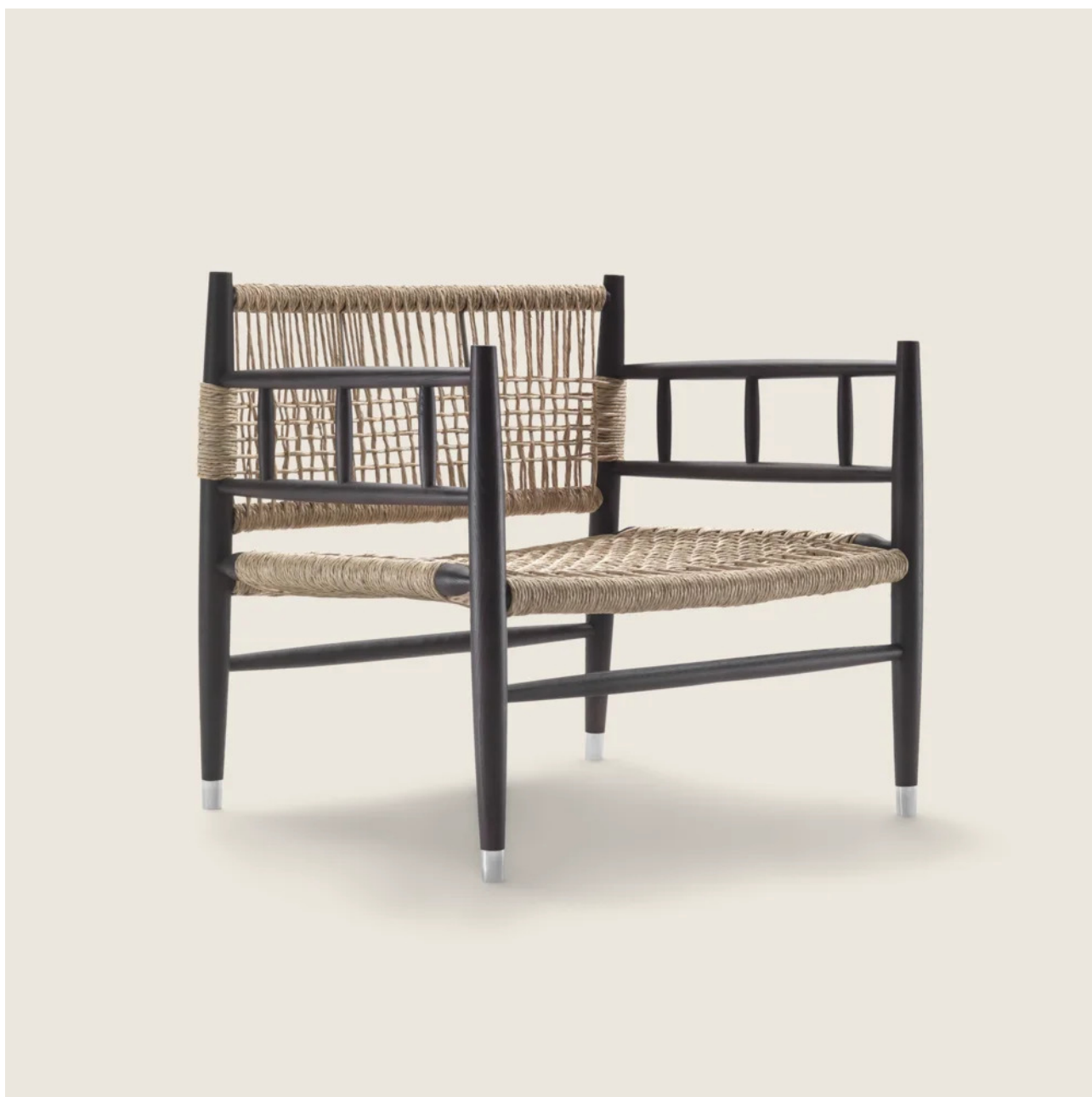
LEE ANTONIO CITTERIO 2021 ARMCHAIRS