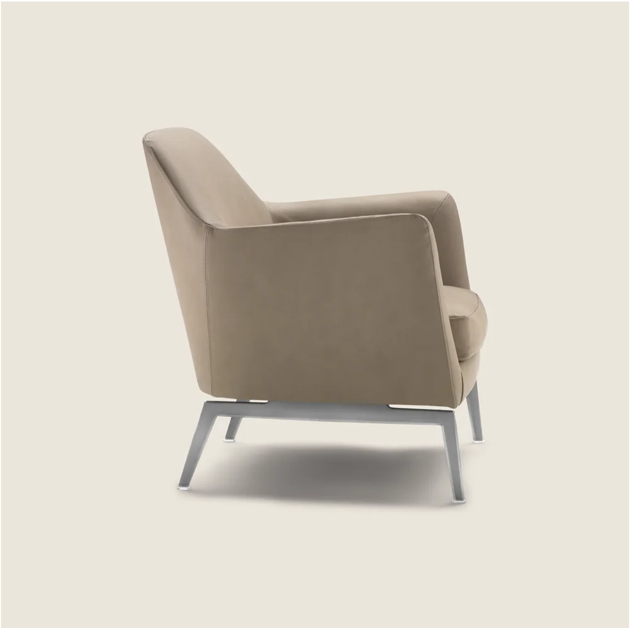
LUCE ANTONIO CITTERIO 2015 ARMCHAIRS